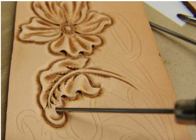
Lifting using the small (#1) lifter

The photo above shows how different sizes of lifters are used on a design. It creates a more natural appearance because not all of the lifts are the same size.