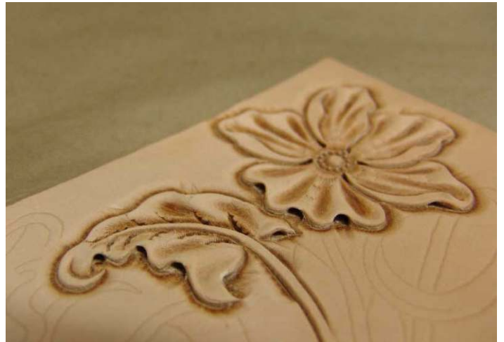
All lifting is completed!